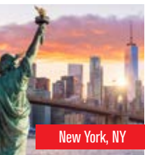
New York, NY

Ritz-Carlton Family Escape: six-day/five-night trip for four (2 adults/2 children under 18), accommodations at your choice of 27 Ritz-Carlton properties located within the 48 contiguous states