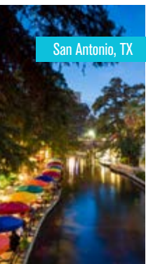
San Antonio, TX

Orlando, Florida Family Reward: four-day/three-night trip for four (2 adults/2 children under 18), accommodations at Disney's Coronado Springs Resort