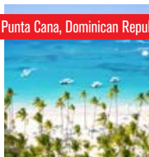
Punta Cana, Dominican Republic