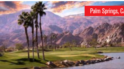
Palm Springs, CA